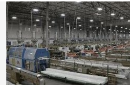
Utilized as substrate for co-extrusion