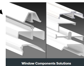
Window Components Solutions